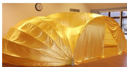
Golden Tent art installation – a place to simply 'be'.